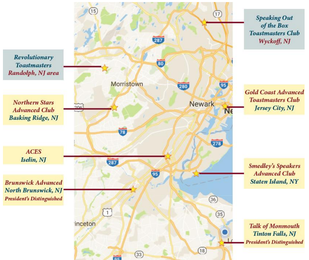
Map courtesy of Talk of Monmouth and Northern Stars (March 2017)

There are currently six advanced clubs in our district (yellow boxes). Two more are forming and are expected to charter soon (gray boxes).